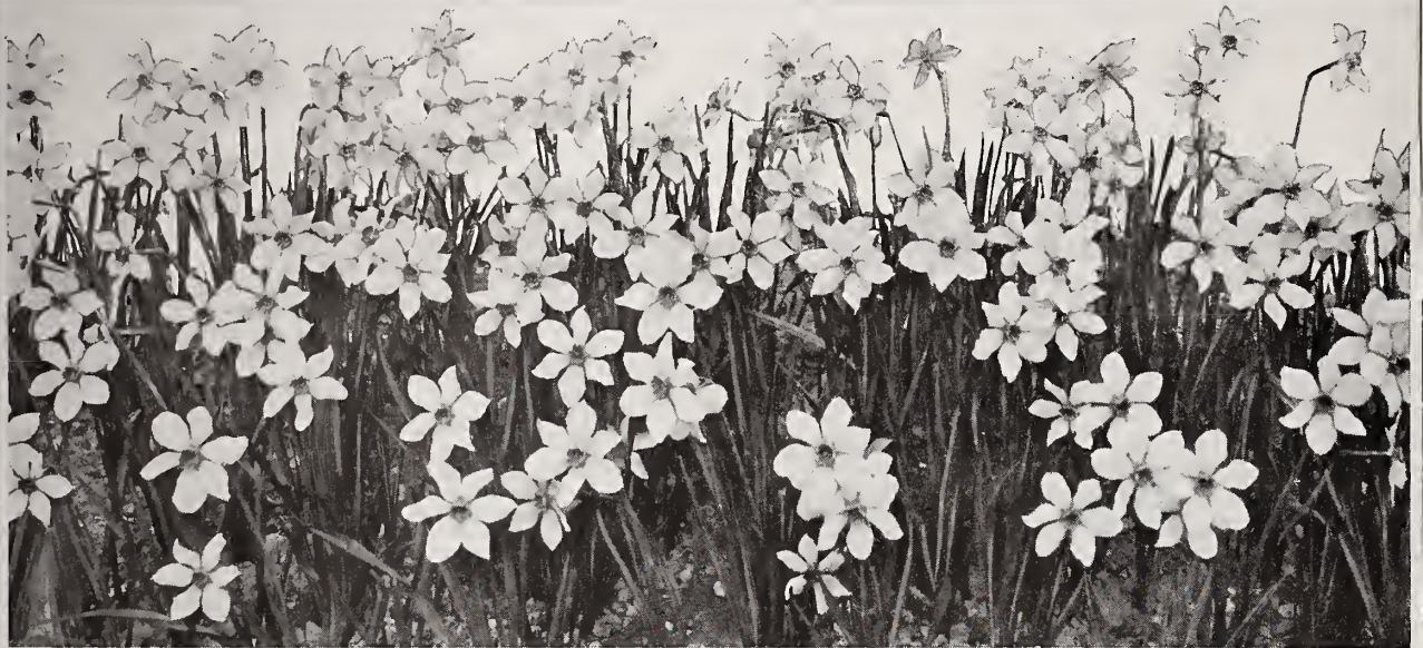
Narcissus Conspicuous. One of the charming Barrii types listed on page 22 of this catalogue